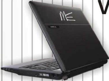
HCL ME Laptop 50